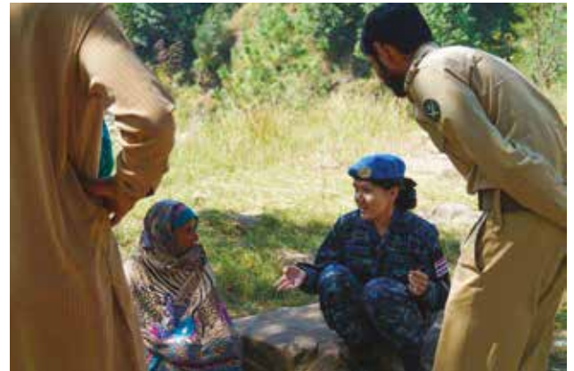
Interaction with the local population for building rapport and collecting information is an important part of a peacekeeper's duty at UNMOGIP. A female peacekeeper is seen talking to a local woman.