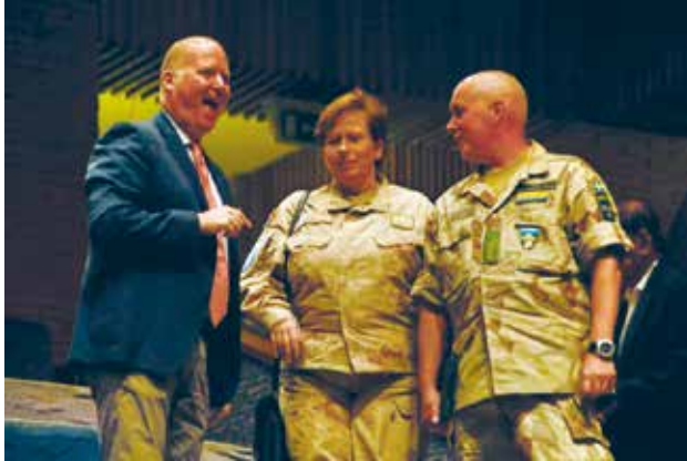
United Nations Military Observers and Director United Nations Information Centre at the screening of documentary 'A Journey of a Thousand Miles: Peacekeepers'

mentioned that in all fields of peacekeeping, women have proven that they can perform the same roles, to the same standards and under the same difficult conditions, as their male counterparts.