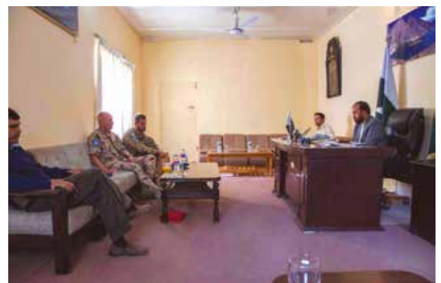
CMO meeting with the Deputy Commissioner of Shigar, Skardu, Aug. 31, 2017.