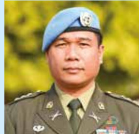
COLONEL ORIEL PANGCO

“UNMOGIP being one of the smallest peacekeeping operations, our footprint is proportionate when it comes to environmental impact. However, when it comes to the environment, no action is small. It is the individual and collective responsibilities that bring change to saving our environment. Our collective actions on the environment as small missions together with those of big missions can become a global driver of change.”