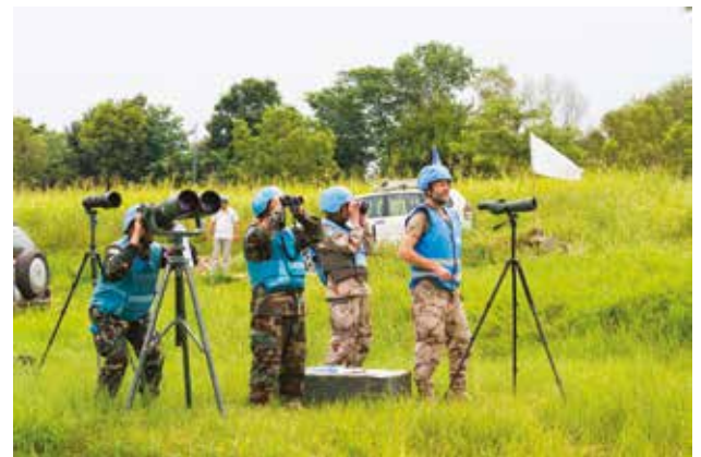
CMO together with a team of observers from Kotli during an Observation Post, Chattar, Aug. 26, 2017