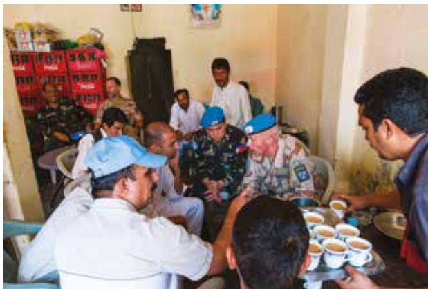
CMO joined a team of UN peacekeepers from Kotli Field Station for an area reconnaissance. It is a way to show presence and talk to the locals about any new developments in the area, Kotli, Aug. 26, 2017