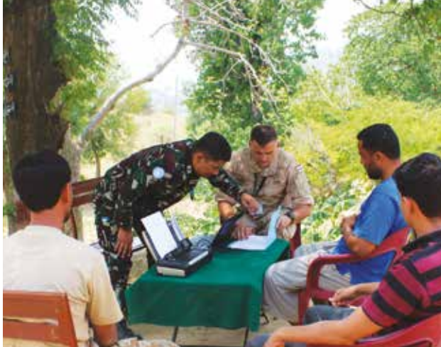
UN Military Observers carrying out an investigation in Domel Field Station with local witnesses.